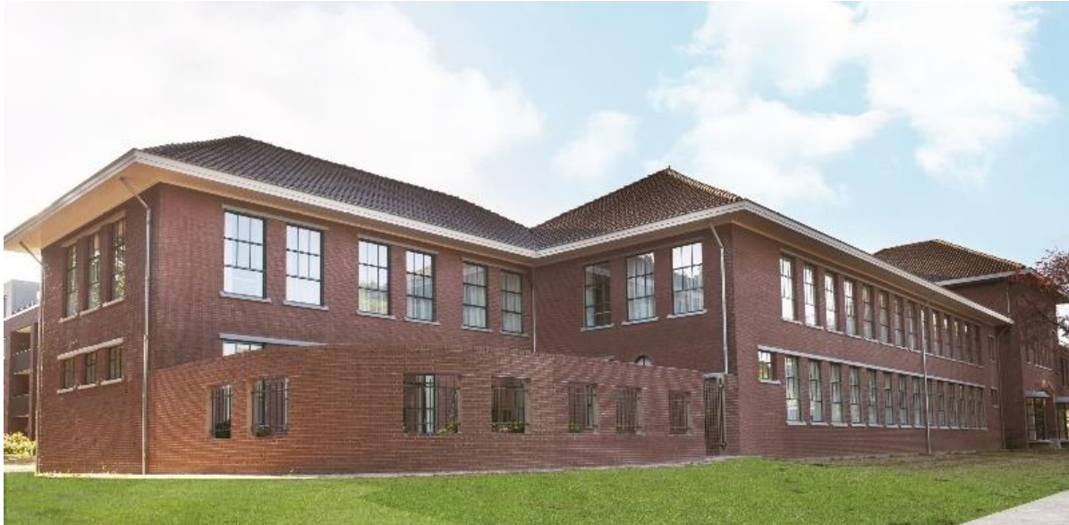
Saksen Weimar 1 - Arnhem

Aedifica is pleased to announce the acquisition of a new senior housing site in The Netherlands.